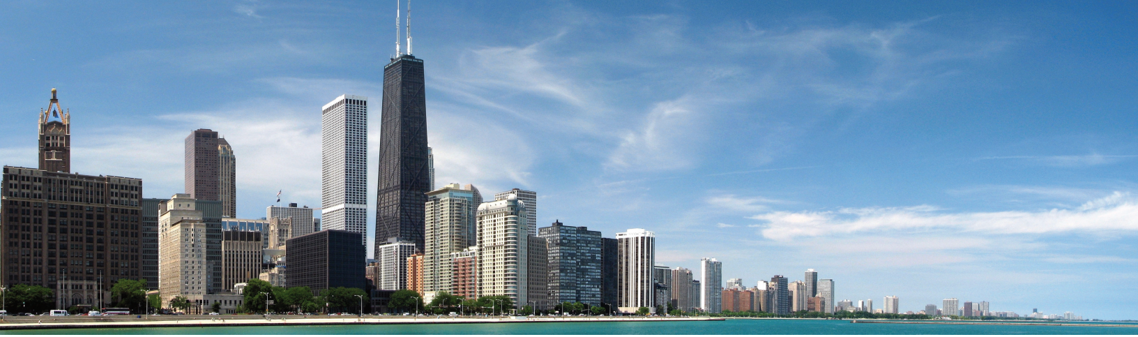
EXHIBIT RULES AND REGULATIONS

1) SETUP AND BREAKDOWN TIMES: You will have access to the exhibit area to set up your booth on Saturday October 20th from 6:30am-8:30 am. Breakdown will be Sunday October 21st, from 3pm-4pm.